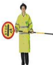
Barrier to stop pedestrians crossing