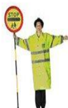
All vehicles must stop

Please confirm you are able to meet these requirements.