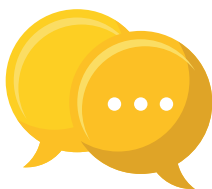
Staff engagement group

The college also has a range of measures to support staff wellbeing, such as: