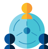
On-site access to HR