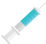
Free flu vaccinations