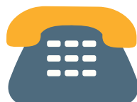
Free telephone counselling service